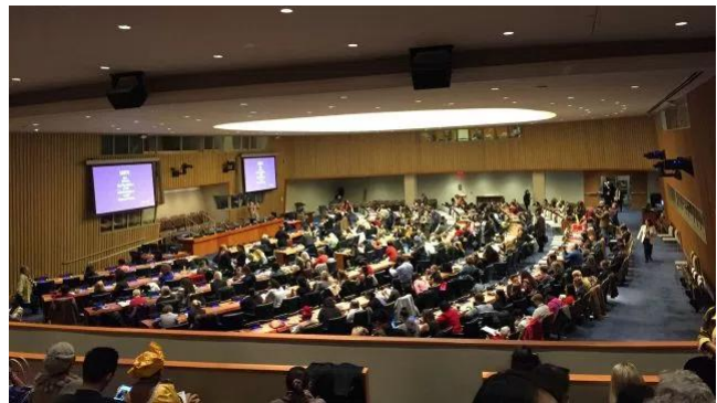
Opening Ceremony of CSW 60 New York